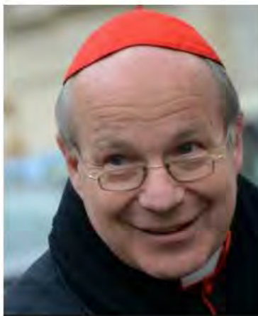
Cardinal Christoph Schönborn (La Croix International, 13 April 2017)

“I can understand the malaise which women feel when they see only men concelebrate. I can understand that we must look like a men’s squad up at the altar.”